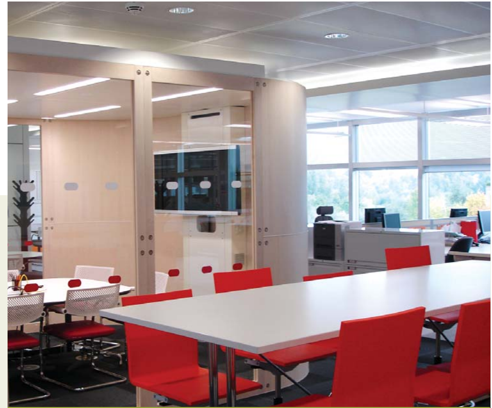
Break-out Meeting Areas